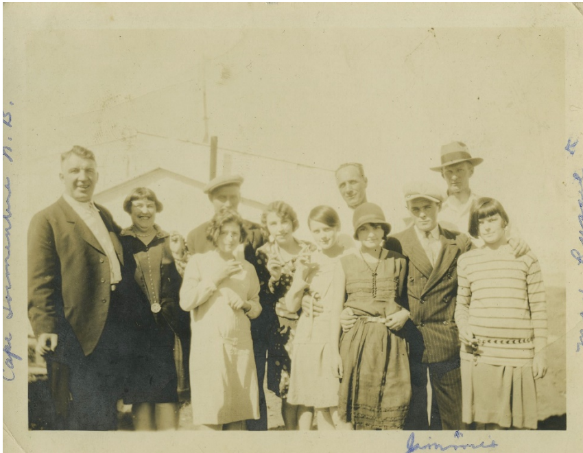
Cape Commerce N.S.