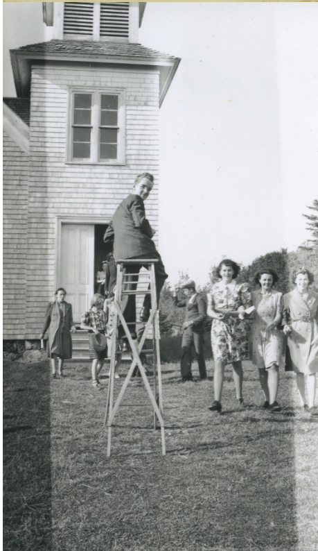
Back Side: Pictou Island Church Movie View 1975